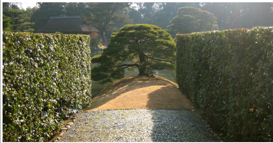
■ compartments – perspective of space